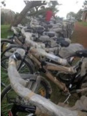
Bikes for girls