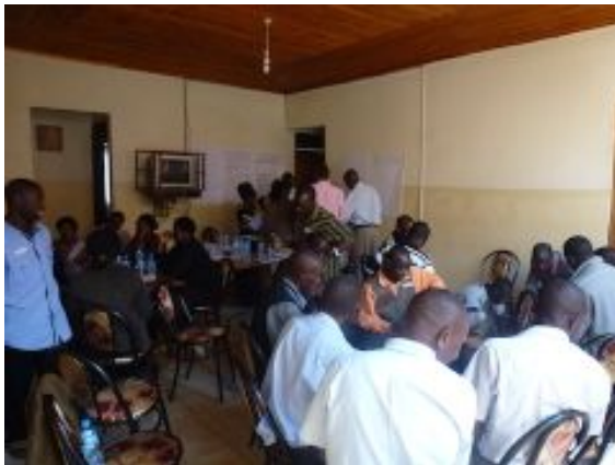
Wildlife Club Patron residential training