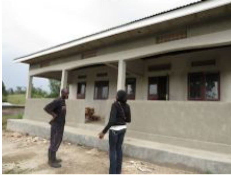
New accommodation for interns and visitors at the Kasiisi Project Farm

The Kasiisi Project Farm added accommodation for interns and a further chicken house. Eggs and piglets continue to be produced and the first steps towards developing an Eco-Campsite have been started.