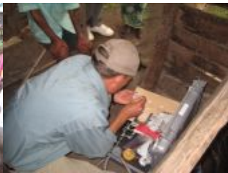
Measuring stove emissions