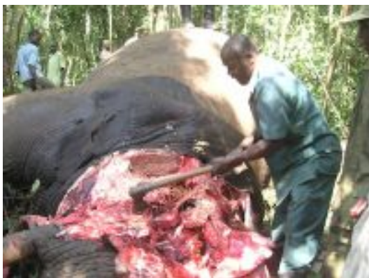
Park Wardens butcher elephant poached for tusks