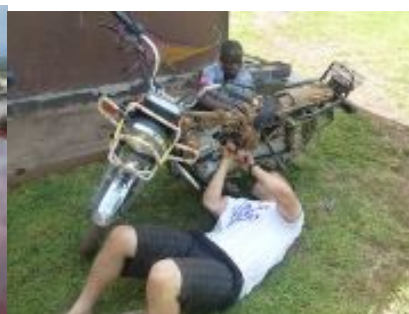
Fixing project motorbikes