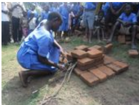
Students learning to build stoves - taught by peers

Students from Iruhuura continued to build stoves in their communities bringing the number of fuel-efficient, clean-burning stoves to 60. The Kasiisi Project has supplied some technical know-how and soap. Otherwise this project continues to be run by students and now that 4 other schools have asked Iruhuura to teach their students how to make the stoves, there is a potential for substantial increase in stove use.