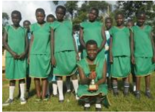
Iruhuura Netball Team – the winners of The Brevard Zoo Netball Cup 2013