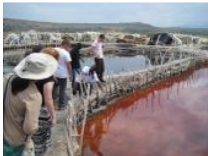
Visiting Katwe Salt Pans