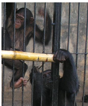
Ngamba chimpanzees "fishing" for honey and peanut butter In puzzles made by Kasiisi Project Children

Funded by Columbus Zoo students from 5 Wildlife Clubs learned about the role of sanctuaries and then made enrichment articles for the chimpanzees living at the Ngamba Island Chimpanzee Sanctuary in Lake Victoria. The enrichment articles were then delivered to the chimpanzees by the children.