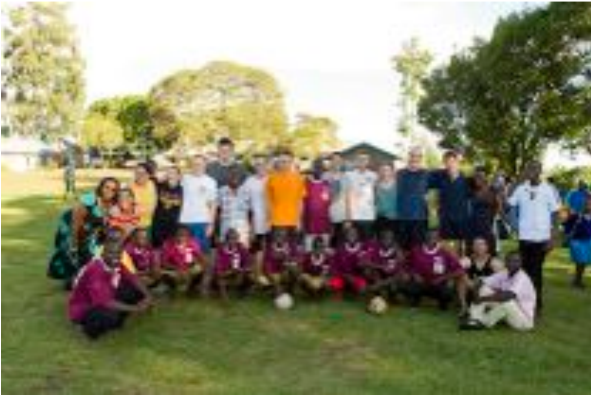
Volunteer team lines up against the Kasiisi Soccer Team – Kasiisi won!