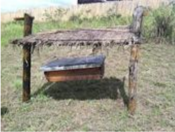
Beehive Elephant Fence at Queen Elizabeth NP