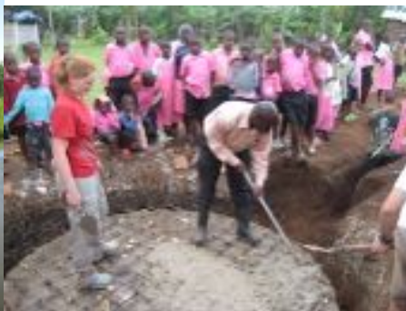
Building rain tank bases