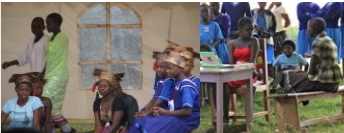
Skits on the importance of parental care and education for girls

Acting on concerns from schools that boys were even more ignorant of sexual matters than girls we began our first workshops for boys.