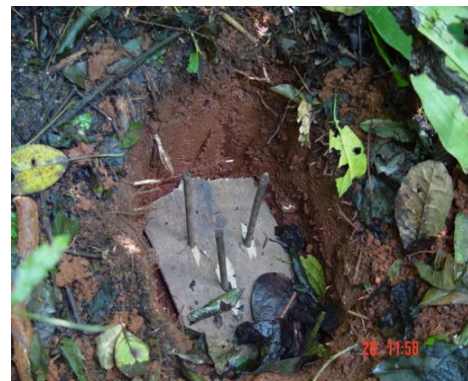
Elephant Foot Trap

Increasing pressures on Kibale's elephants from local and commercial poachers have led to a change in conservation education policy to focus on elephants as much as chimpanzees. Programs for 2015 will primarily address conservation of Elephants